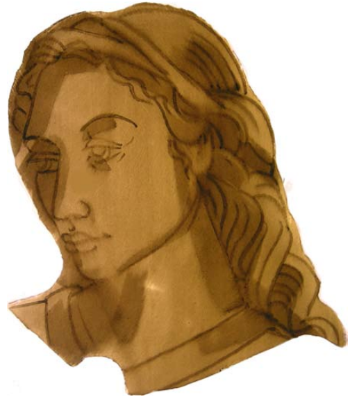
Undercoat, traced lines plus some half-tones then softened and blended with an “overcoat” ...