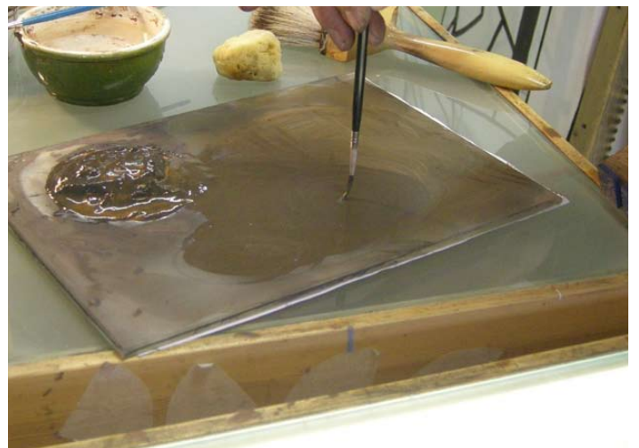
Always use a good-sized palette

When you believe in yourself enough to invest in the best of whatever you can afford, your glass painting will benefit. It's always best to save up for the best rather than rushing to throw money away on anything you can afford.