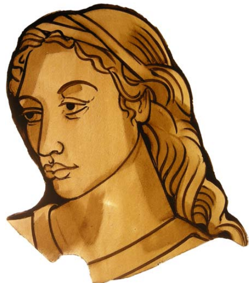
... then further tracing and filling in around the outside – all in just one firing!