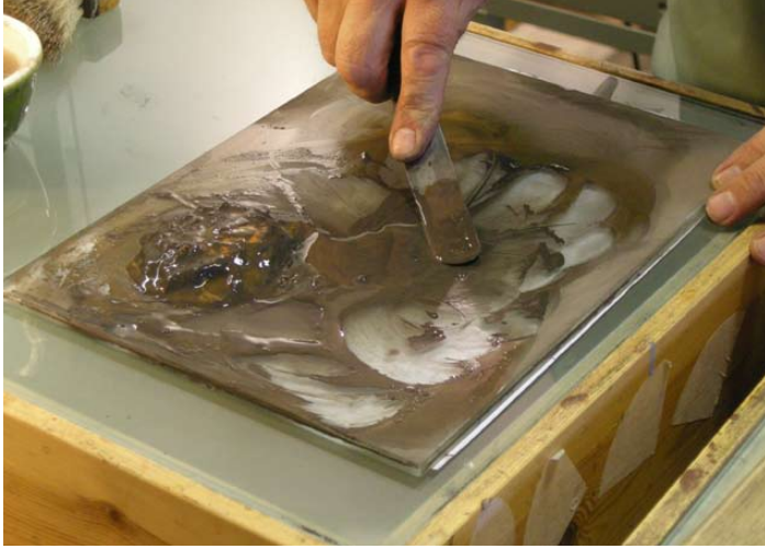
Start with a lump of well-mixed glass paint (not a teaspoonful)